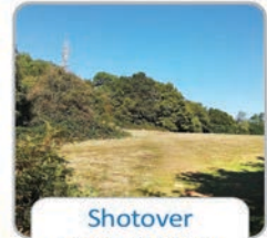
Shotover Country Park