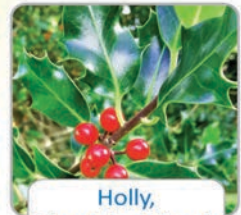
Holly, Magdalen Woods