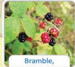
Bramble, Magdalen Woods