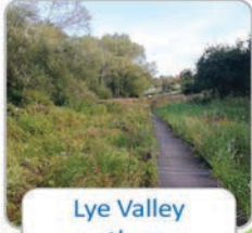
Lye Valley pathway