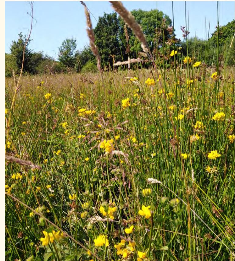
Cae Gwlyb yn ei flodau gyda phlanhigion dól sy'n hoff o leithder Cae Gwlyb in bloom with damp-loving meadow plants