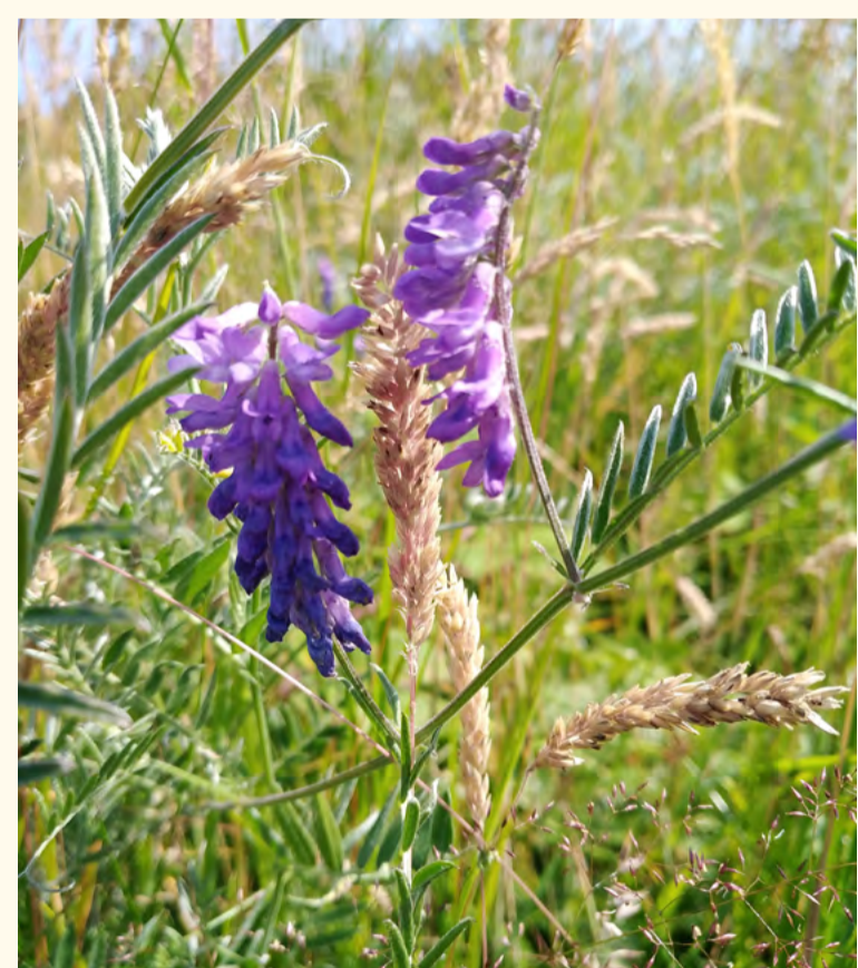
Ffacbys y berth Tufted vetch

Cyfle i brofi Llwybr Iechyd a Lles y Ddôl sy'n cysylltu Ysbyty Gwynedd â dolydd Gwarchodfa Natur Eithinog yr Ymddiriedolaeth Fwyd Gwylt. Yn ystod pob tymor, mae mynd am dro drwy ddôl yn cynnig gwledd o liwiau, arogleuon a synau.