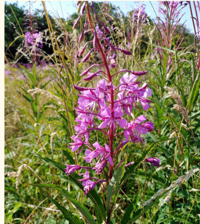
Helygllys hardd Rosebay willowherb