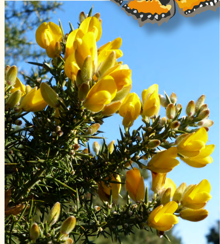
Eithin Ewropeaidd European gorse