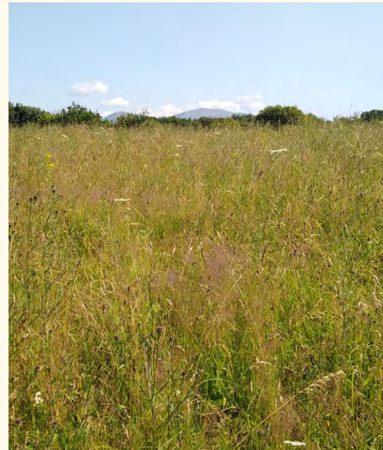
Dôl yn llawn blodau gyda golygfeydd draw am fynyddoedd Eryri Meadow full of flowers with distant views of the mountains of Snowdonia